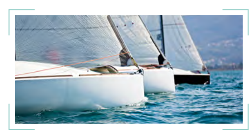
We help investors to realise maximum value from their assets using rigorous analysis and sector expertise across the investment lifecycle.